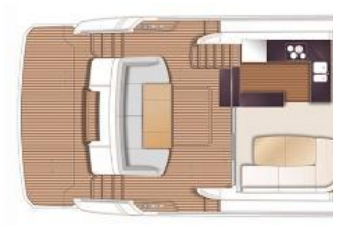
Manufacturer Provided Image: Princess F70 Lower Deck Layout Plan