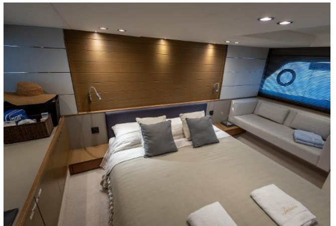
Princess V58 Open