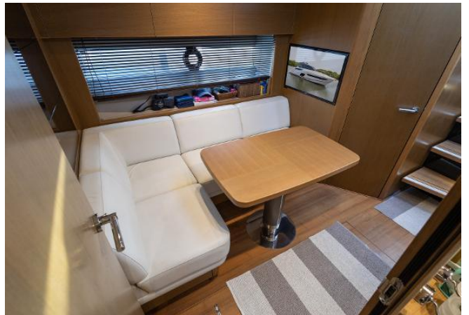
Princess V58 Open