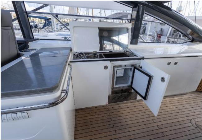
Princess V58 Open