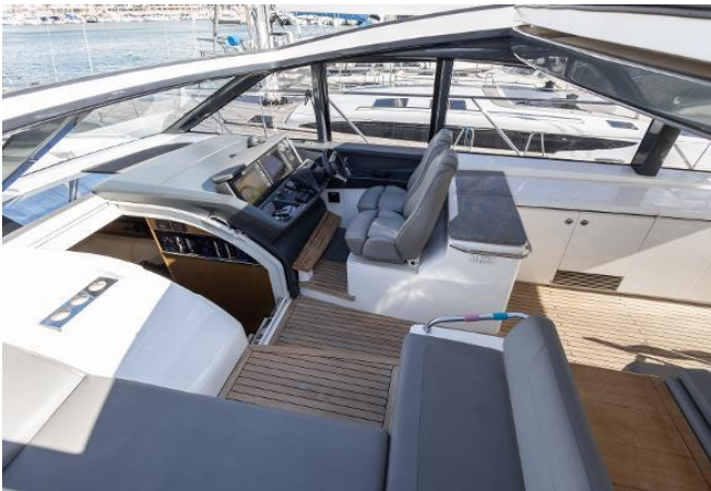
Princess V58 Open