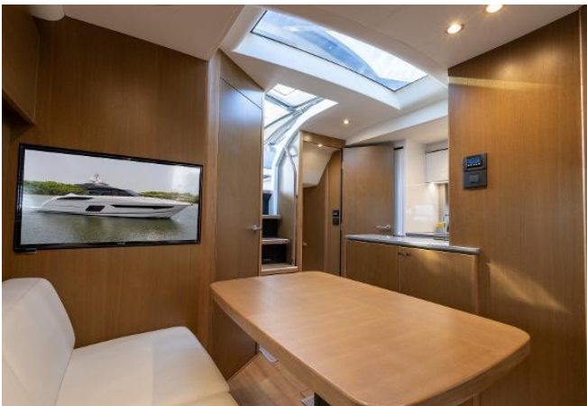
Princess V58 Open