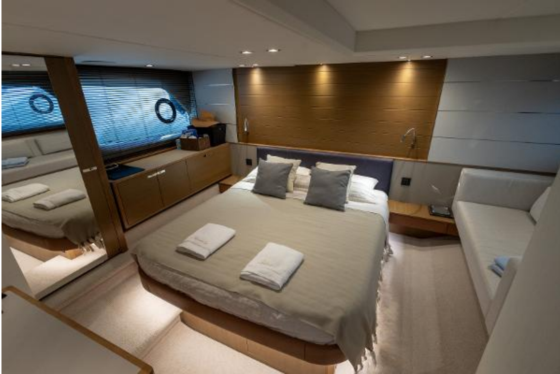
Princess V58 Open