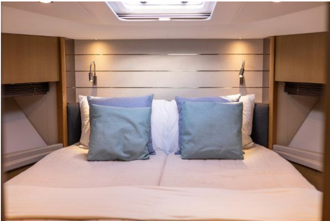
Princess V58 Open