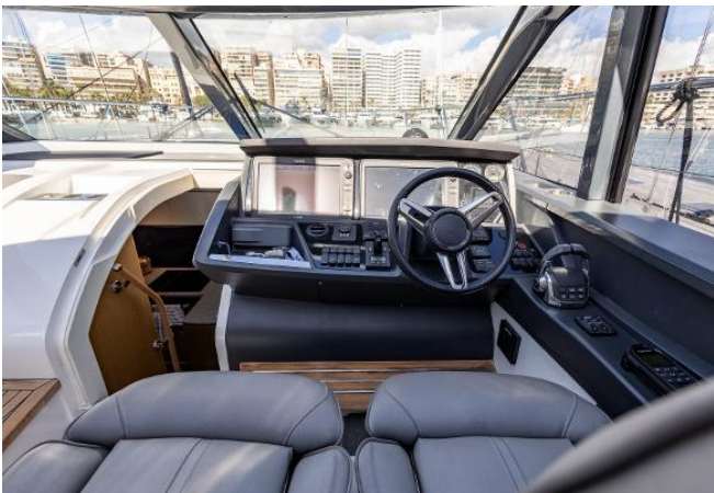
Princess V58 Open