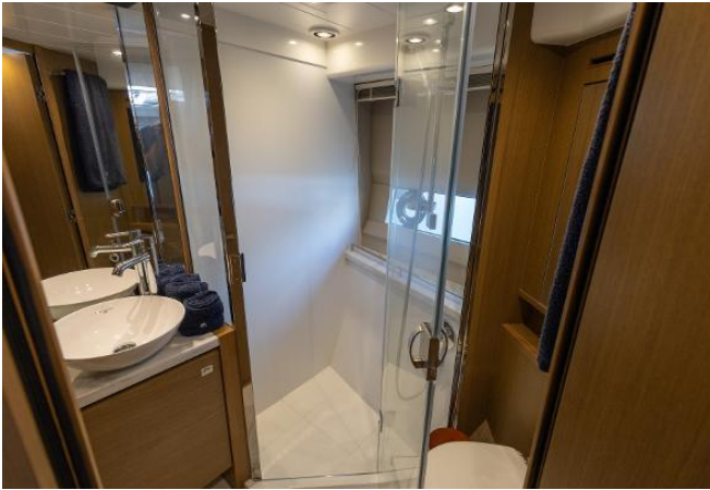
Princess V58 Open