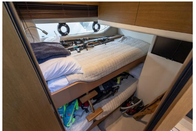
Princess V58 Open