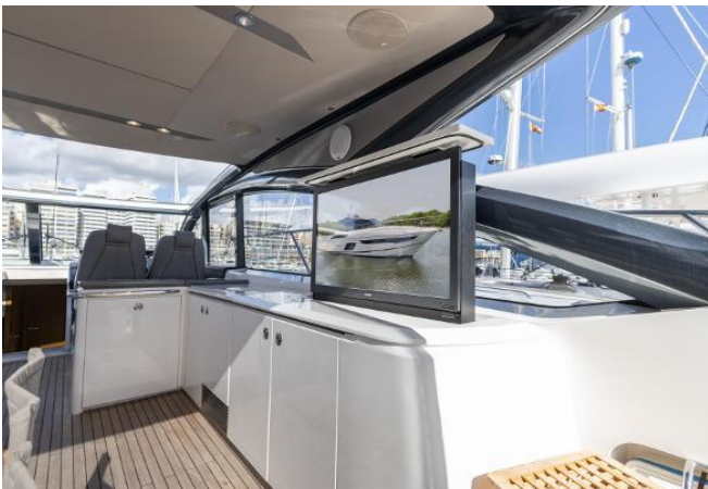
Princess V58 Open