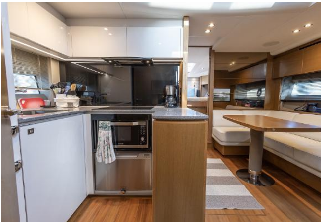
Princess V58 Open