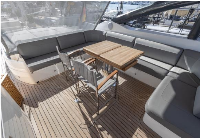
Princess V58 Open