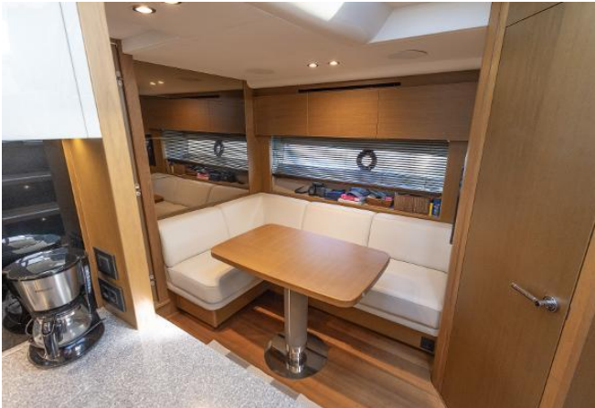
Princess V58 Open