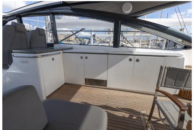
Princess V58 Open