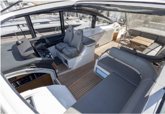
Princess V58 Open