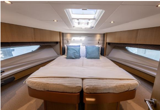
Princess V58 Open