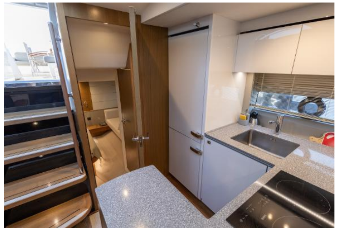
Princess V58 Open