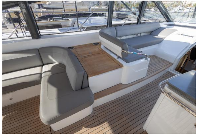
Princess V58 Open