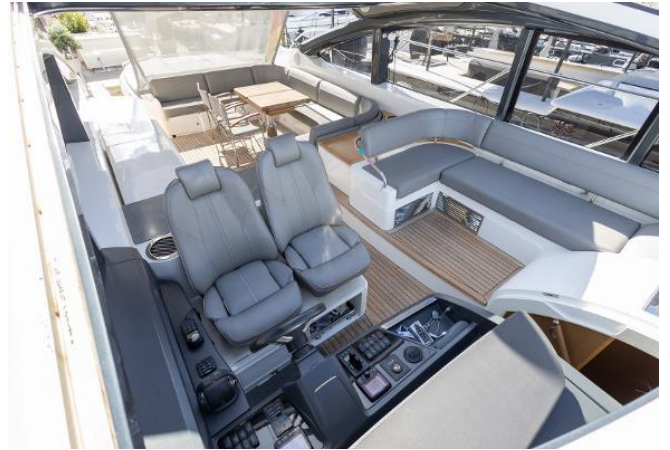
Princess V58 Open