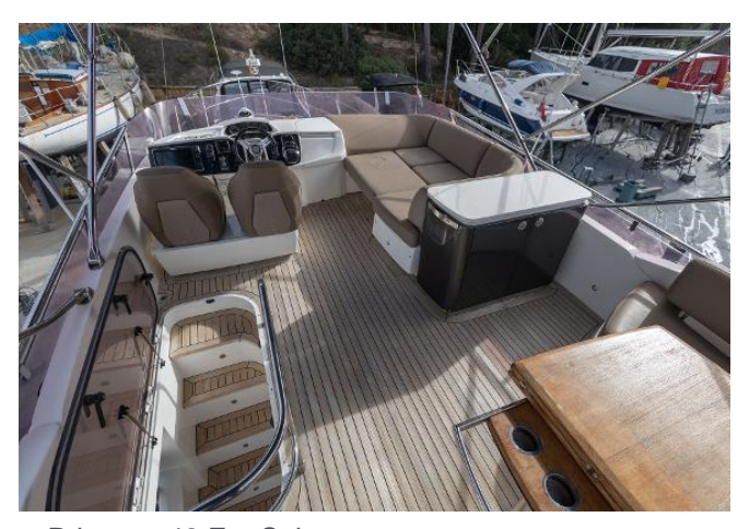
Princess 43 For Sale