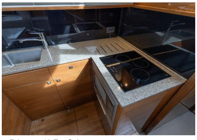
Princess 43 For Sale