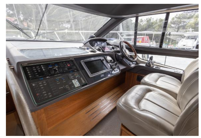
Princess 43 For Sale