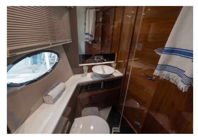
Princess 43 For Sale