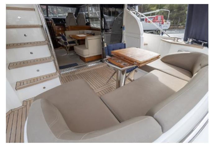
Princess 43 For Sale