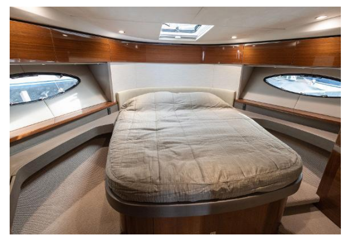
Princess 43 For Sale