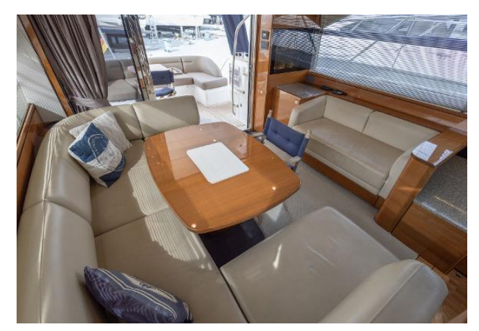
Princess 43 For Sale