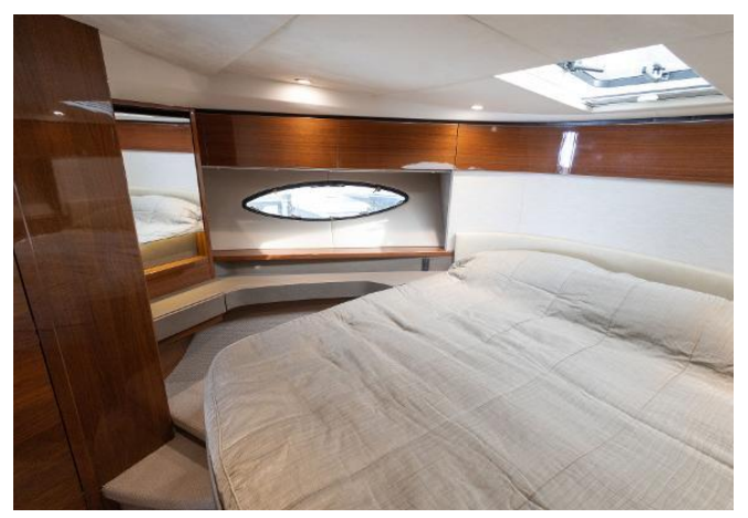
Princess 43 For Sale