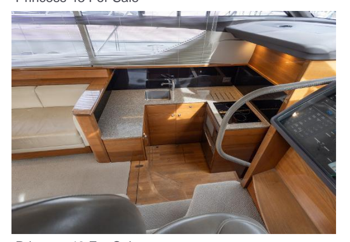
Princess 43 For Sale