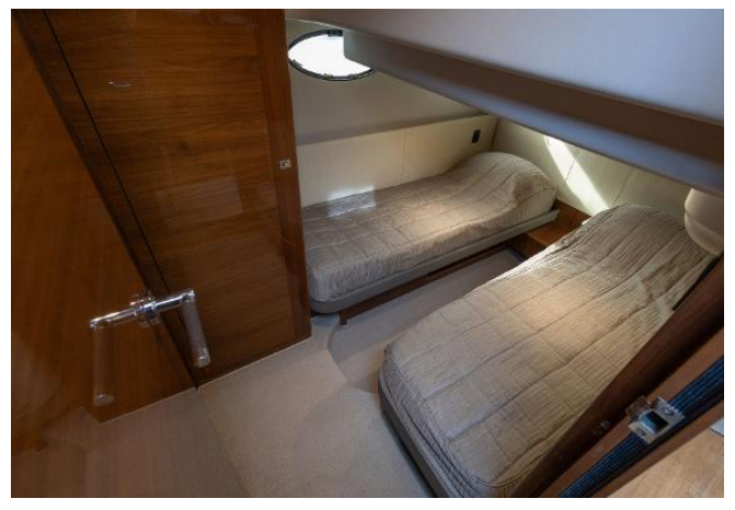
Princess 43 For Sale