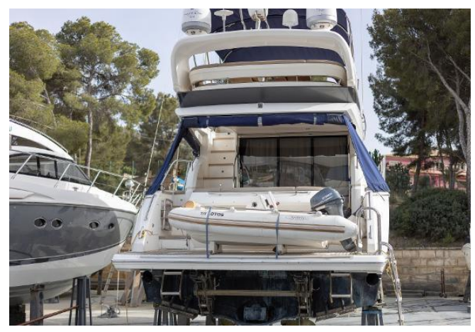
Princess 43 For Sale