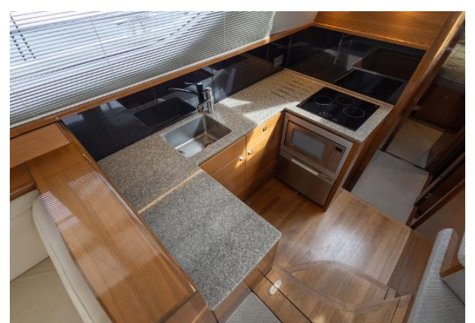
Princess 43 For Sale