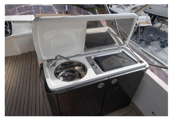
Princess 43 For Sale