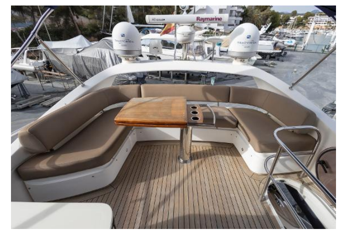
Princess 43 For Sale