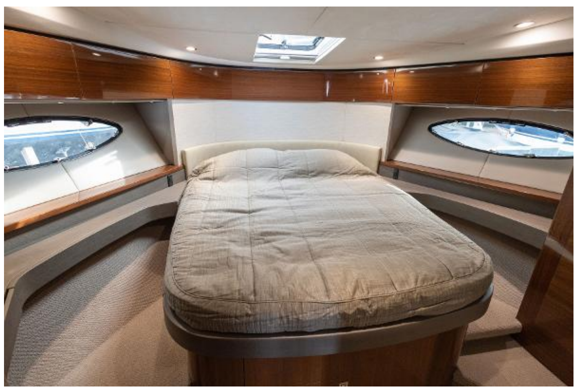
Princess 43 For Sale