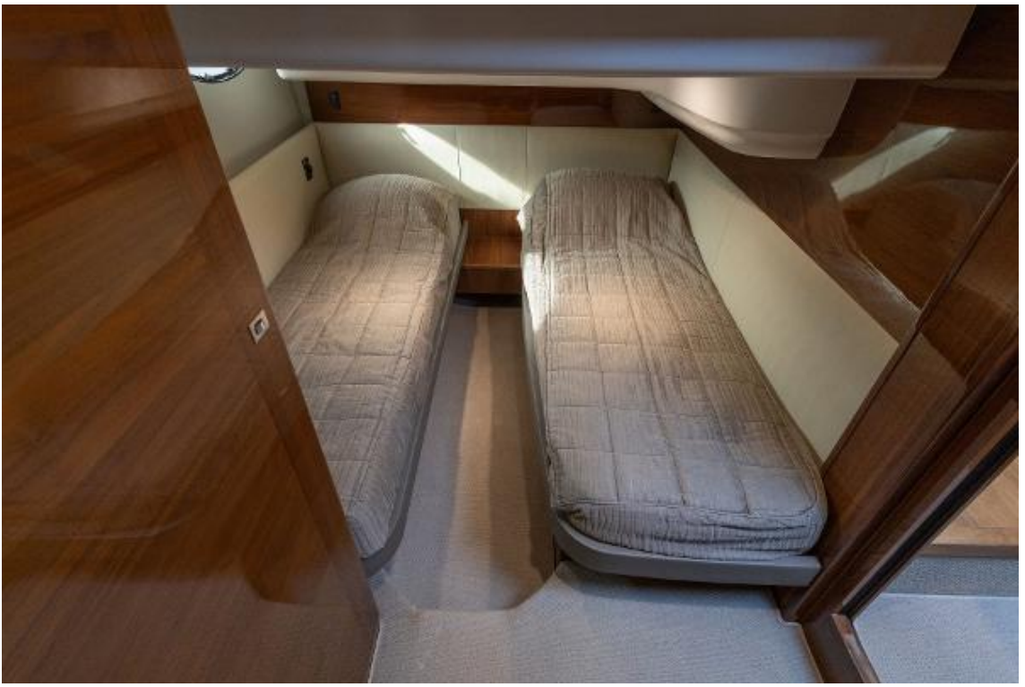
Princess 43 For Sale

Email: balearicsbrokerage@princessmysales.com Tel: +34 971 676 439