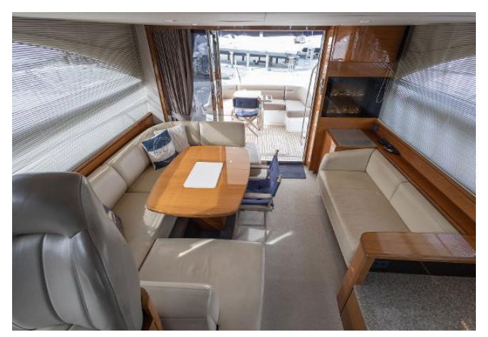
Princess 43 For Sale