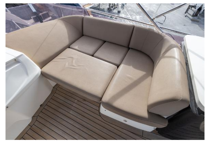
Princess 43 For Sale