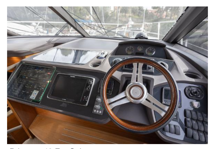
Princess 43 For Sale