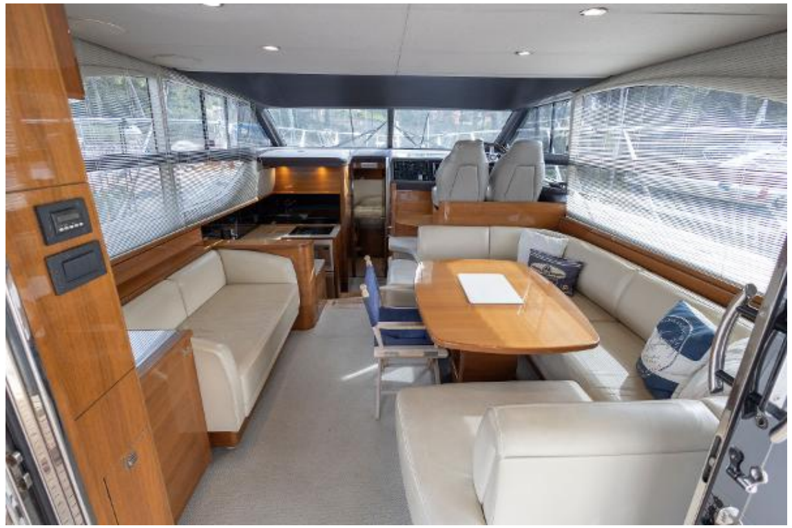
Princess 43 For Sale

Email: balearicsbrokerage@princessmysales.com Tel: +34 971 676 439