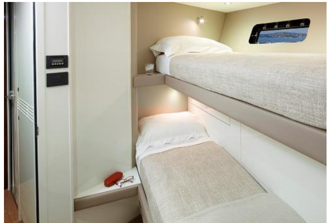
Brochure Image crew cabin