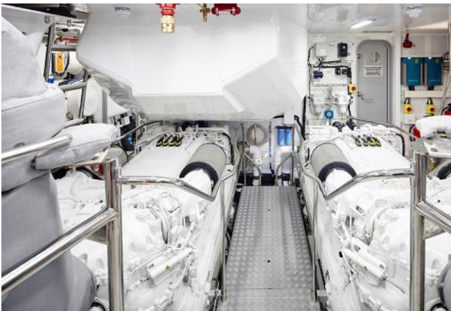
Brochure Image - Princess M Class 30M Engine Room

FINANCE AND INSURANCE AVAILABLE ON THIS PRINCESS YACHT