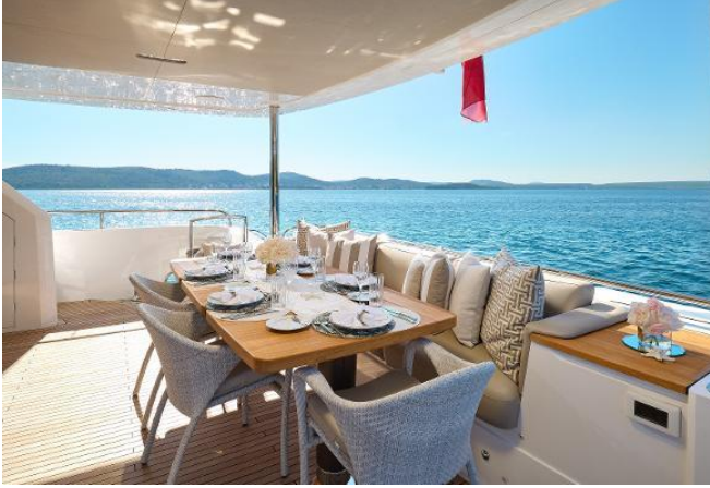
Princess 30M For Sale