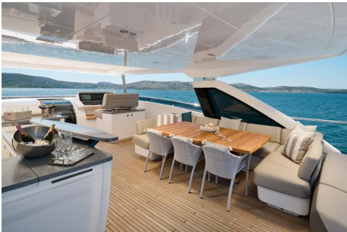
Princess 30M For Sale