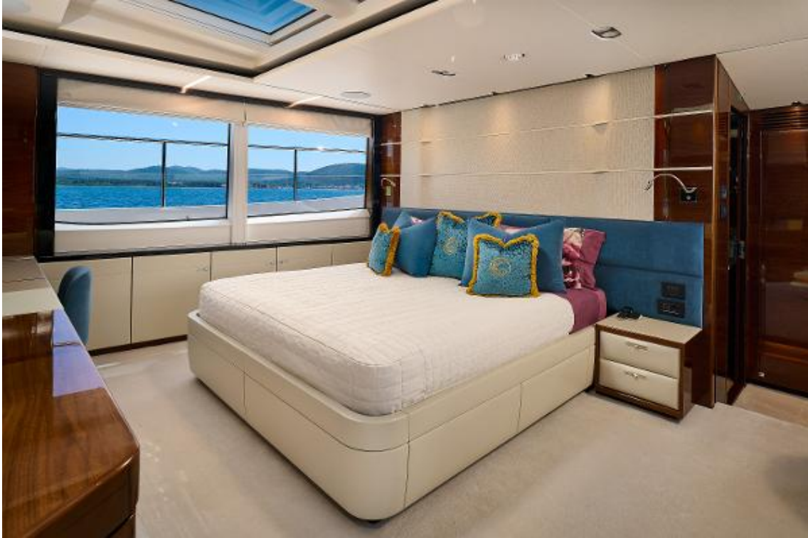
Princess 30M For Sale