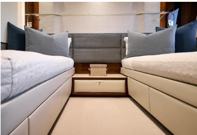
Princess 30M For Sale