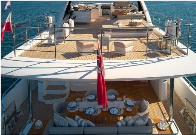
Princess 30M For Sale