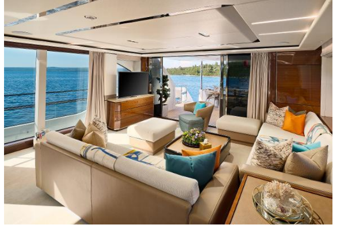
Princess 30M For Sale