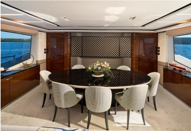
Princess 30M For Sale