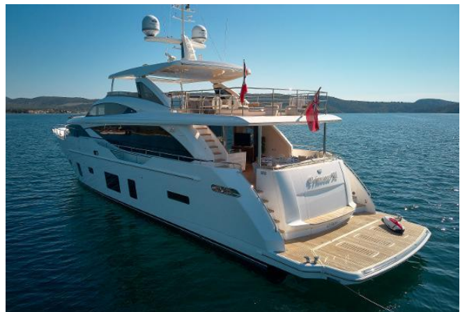
Princess 30M For Sale