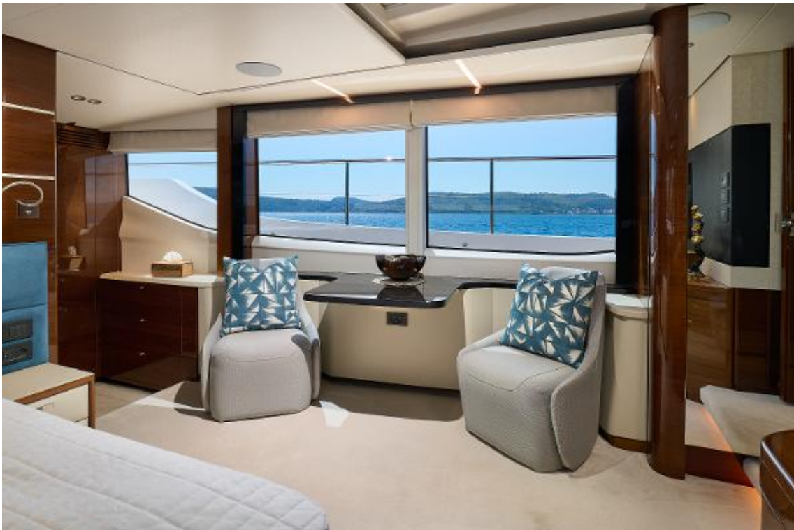
Princess 30M For Sale