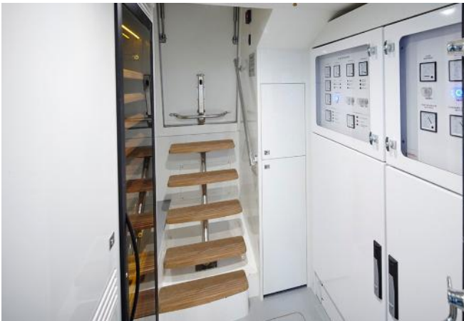
Brochure Image crew cabin