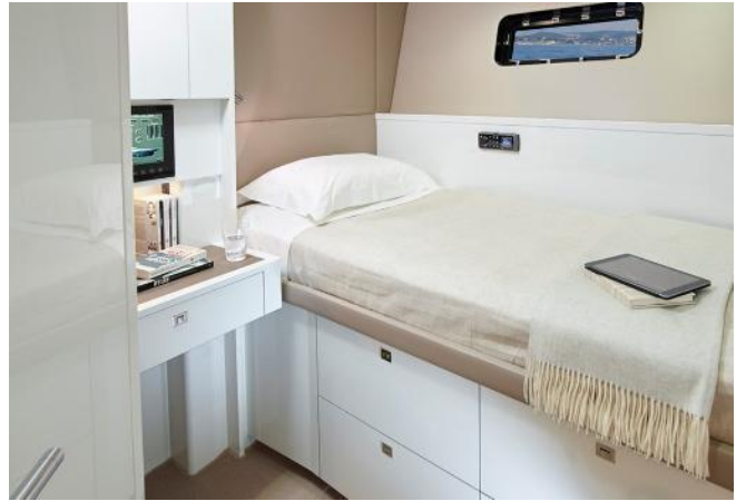
Brochure Image crew cabin