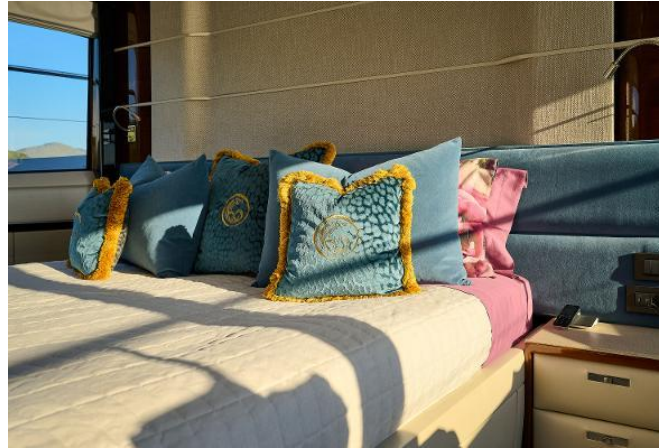
Princess 30M For Sale