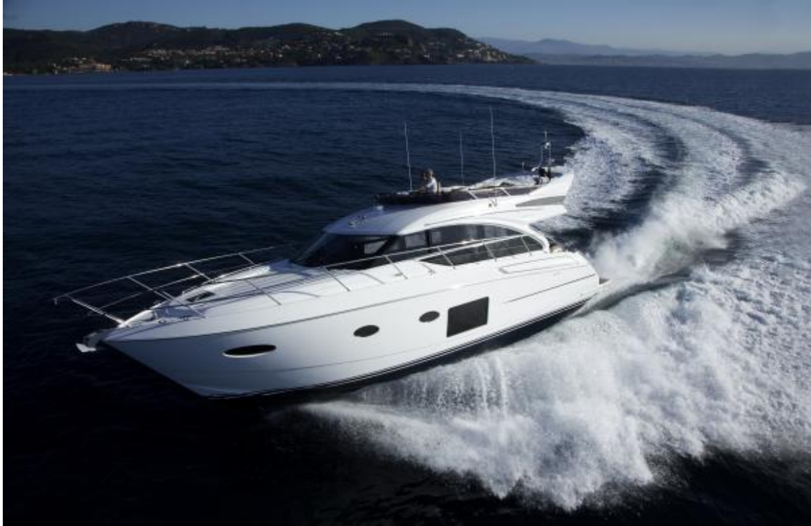
Princess 52