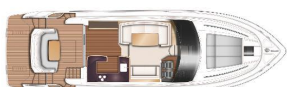
Princess 52 Flybridge Layout