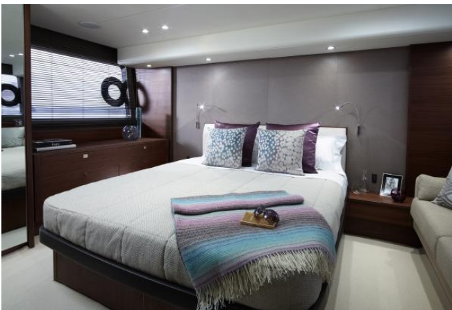
Princess 52 Owner's Stateroom