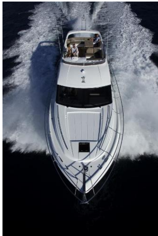
Manufacturer Provided Image: Princess 52 Front View