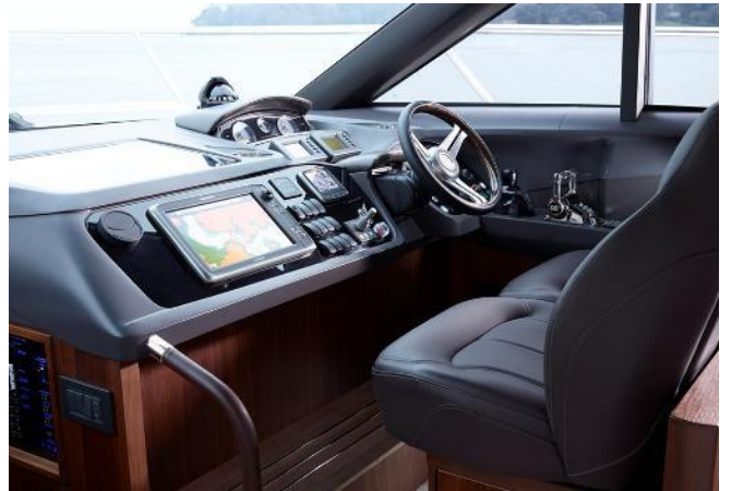
Princess 52 Helm