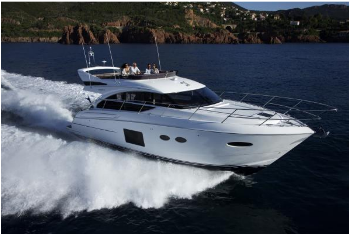
Princess 52 Running Shot