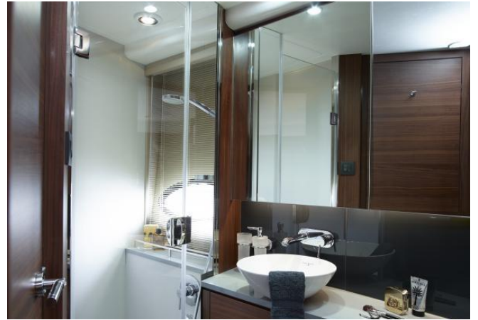
Princess 52 Forward Guest Cabin