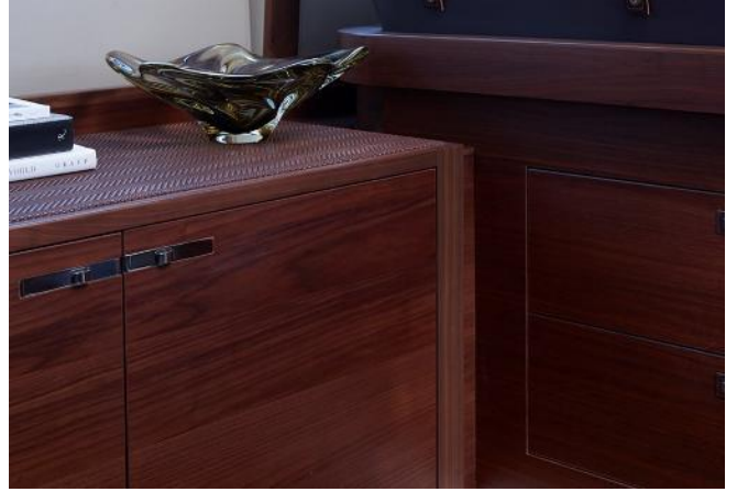
Manufacturer Provided Image: Princess 52 Saloon Detail