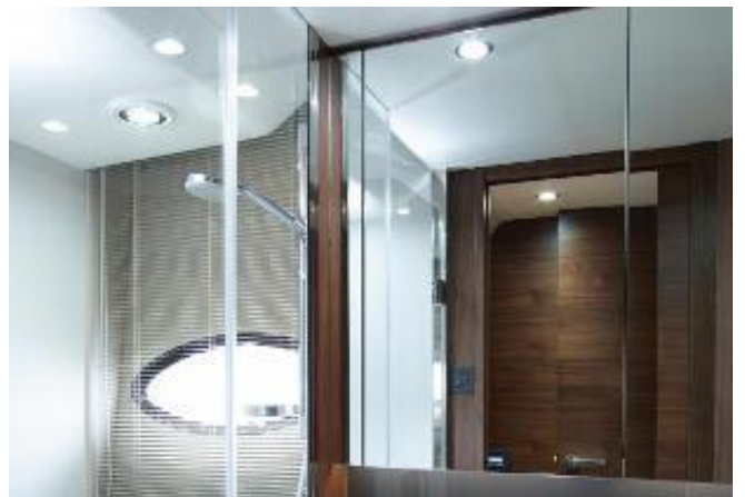
Princess 52 Owner's Bathroom