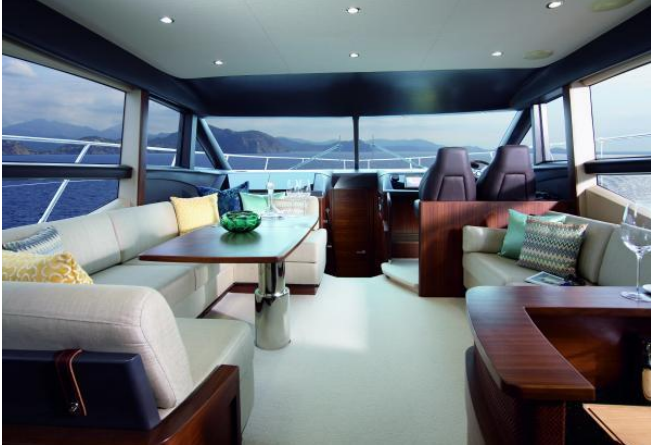
Princess 52 Saloon