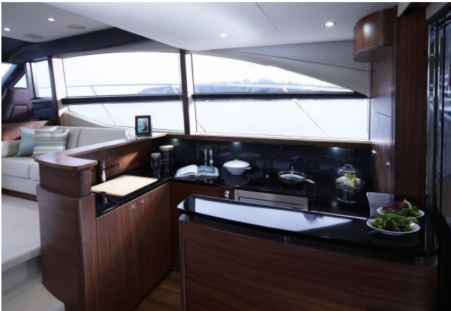
Manufacturer Provided Image: Princess 52 Galley